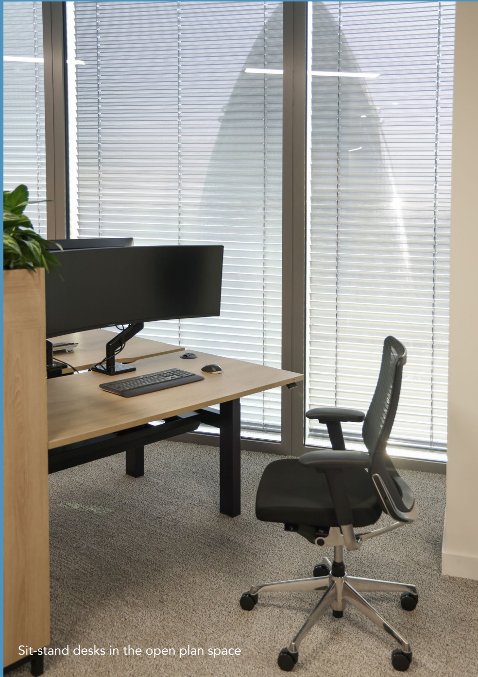
Sit-stand desks in the open plan space