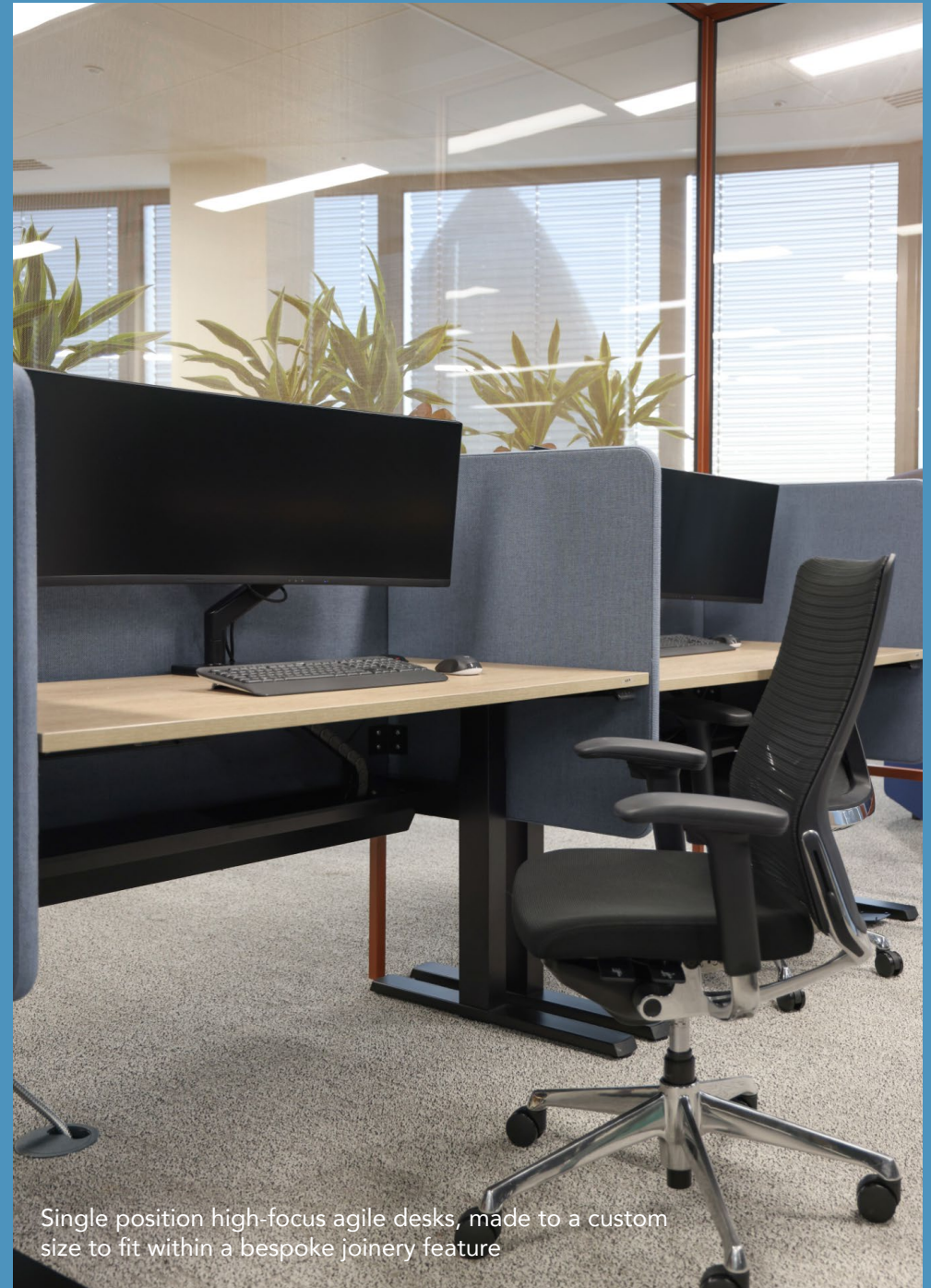
Single position high-focus agile desks, made to a custom size to fit within a bespoke joinery feature