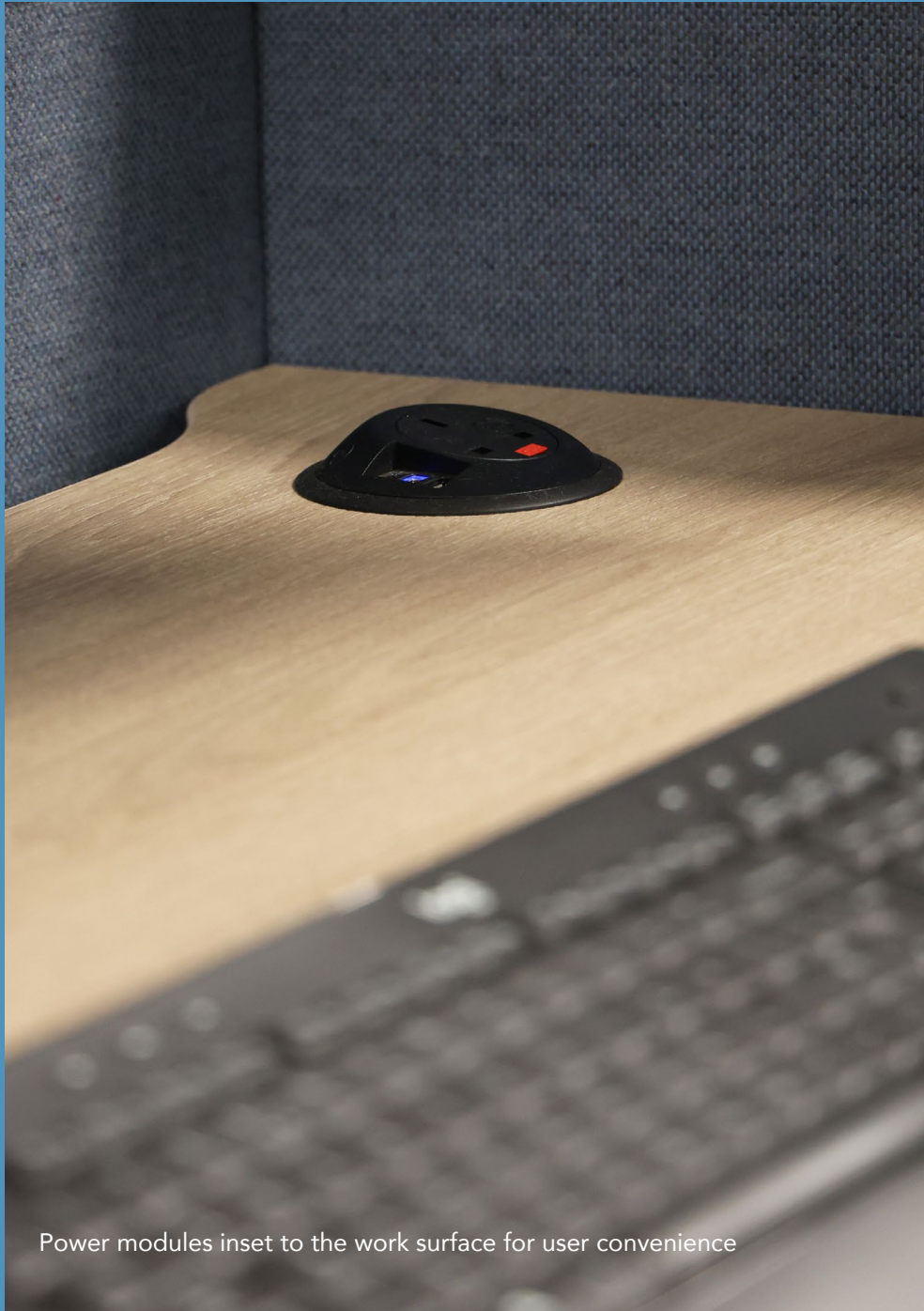
Power modules inset to the work surface for user convenience