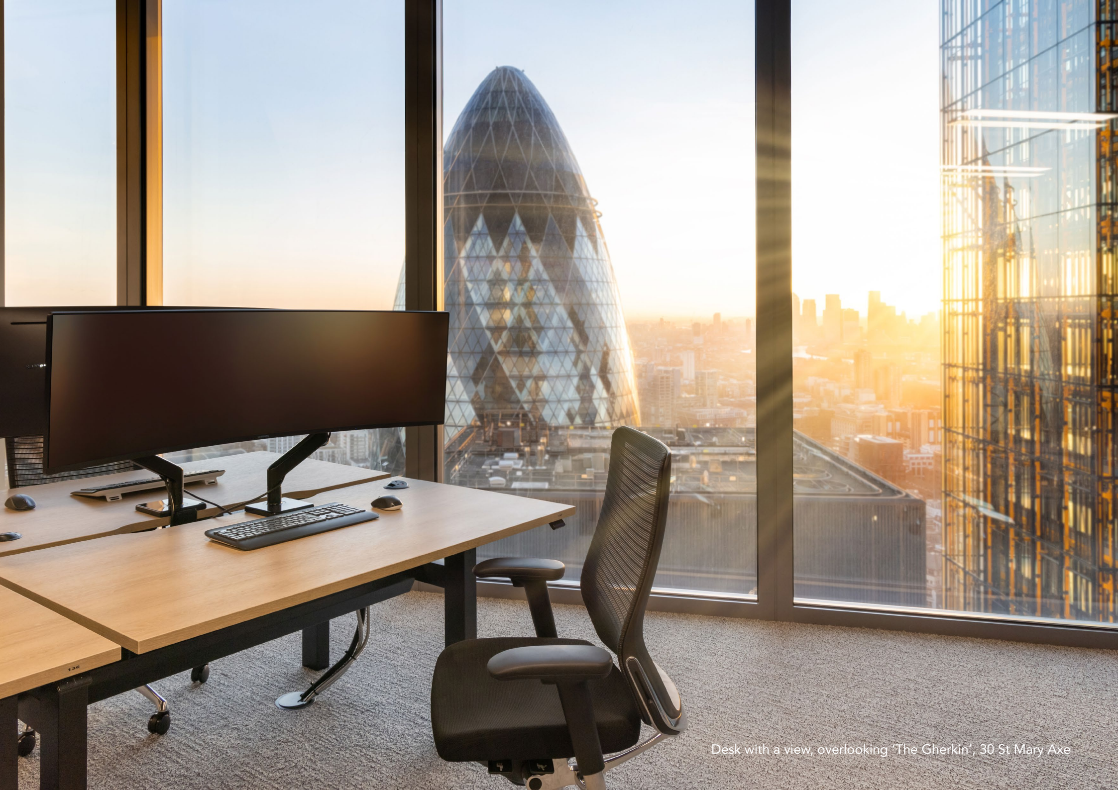
Desk with a view, overlooking 'The Gherkin', 30 St Mary Axe