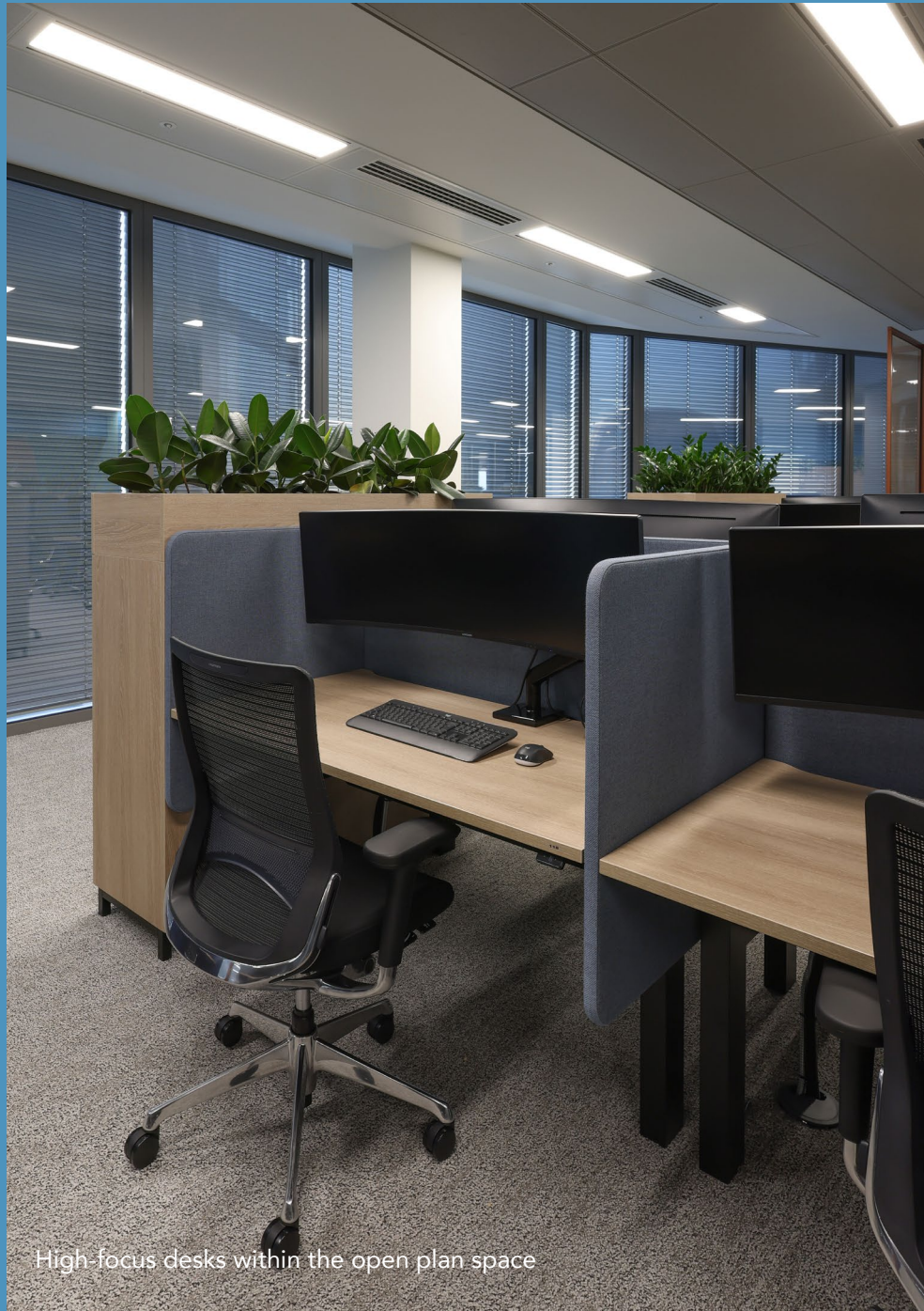
High-focus desks within the open plan space