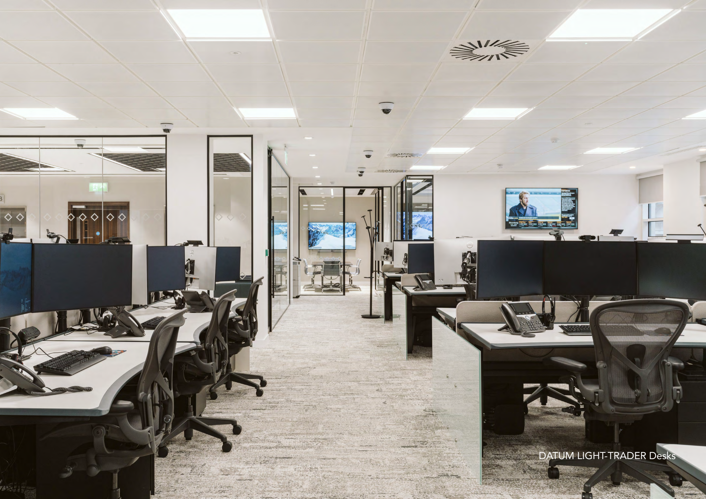
DATUM LIGHT-TRADER Desks